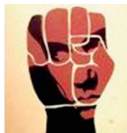
1967 "Black Power"